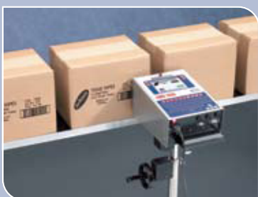
Quattro installed on conveyor